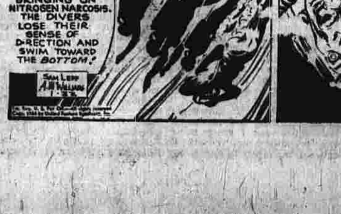
BY LEFF and McWILLIAMS