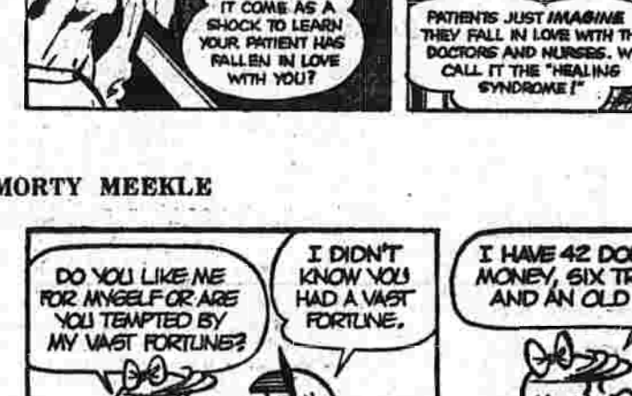
BY ROY CRANE