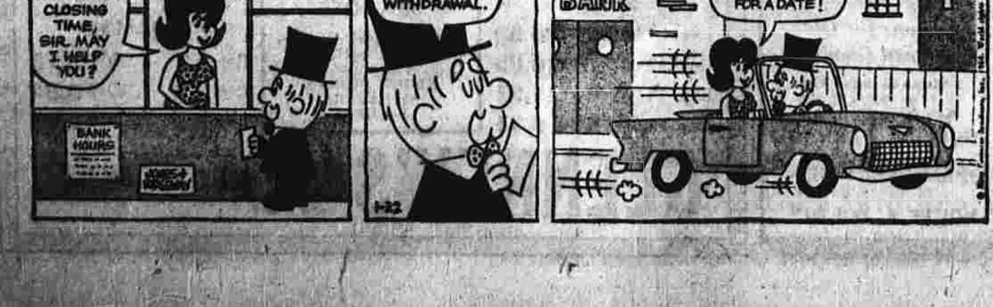
BY LEFF and McWILLIAMS