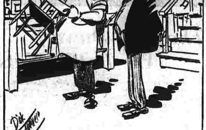
BY JOE CAMPBELL