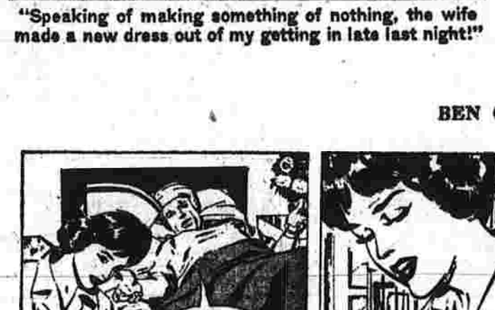
BY FRANK O'NEAL